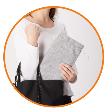
Ultra-slim and foldable mat & carry case