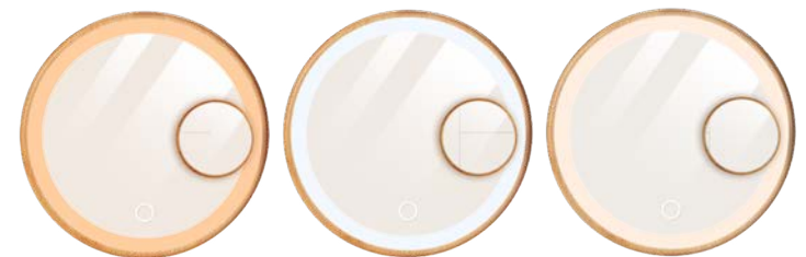
☁☁☁ Warm ☁☁☁

☁☁☁ Natural white, which does not change the perception of colours and is ideal for make-up.