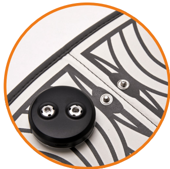
Rechargeable battery by USB