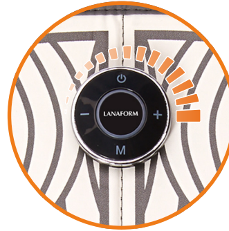
15 intensities & 25 minutes in 2 modes