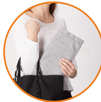
Ultra-slim and foldable mat & carry case